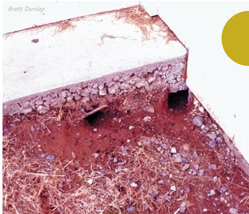
Rats dig burrows that lead to dens under structures.