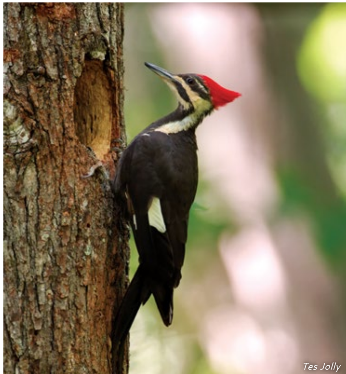
Right: Cavities are critical for many bird species. Various woodpeckers, especially pileated woodpeckers (shown) and northern flickers are primary cavity excavators, and may act as keystone species.