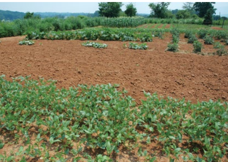
Iron-clay cowpeas were planted on one end of this garden as an alternative food source for rabbits, which were coming out of brushy cover near that end of the garden. Whether cowpeas, clovers, or some other attractive forage, providing an alternative food source with easy access and close to cover can help reduce damage to ornamental or garden plants.

Another frightening agent that should not be overlooked is a dog. When allowed to stay outdoors or with access to a dog door, a dog is a strong deterrent to deer, raccoons, skunks, armadillos, opossums, and geese causing problems around the house. Even a house dog that has access to a dog door can be encouraged to become a guardian.