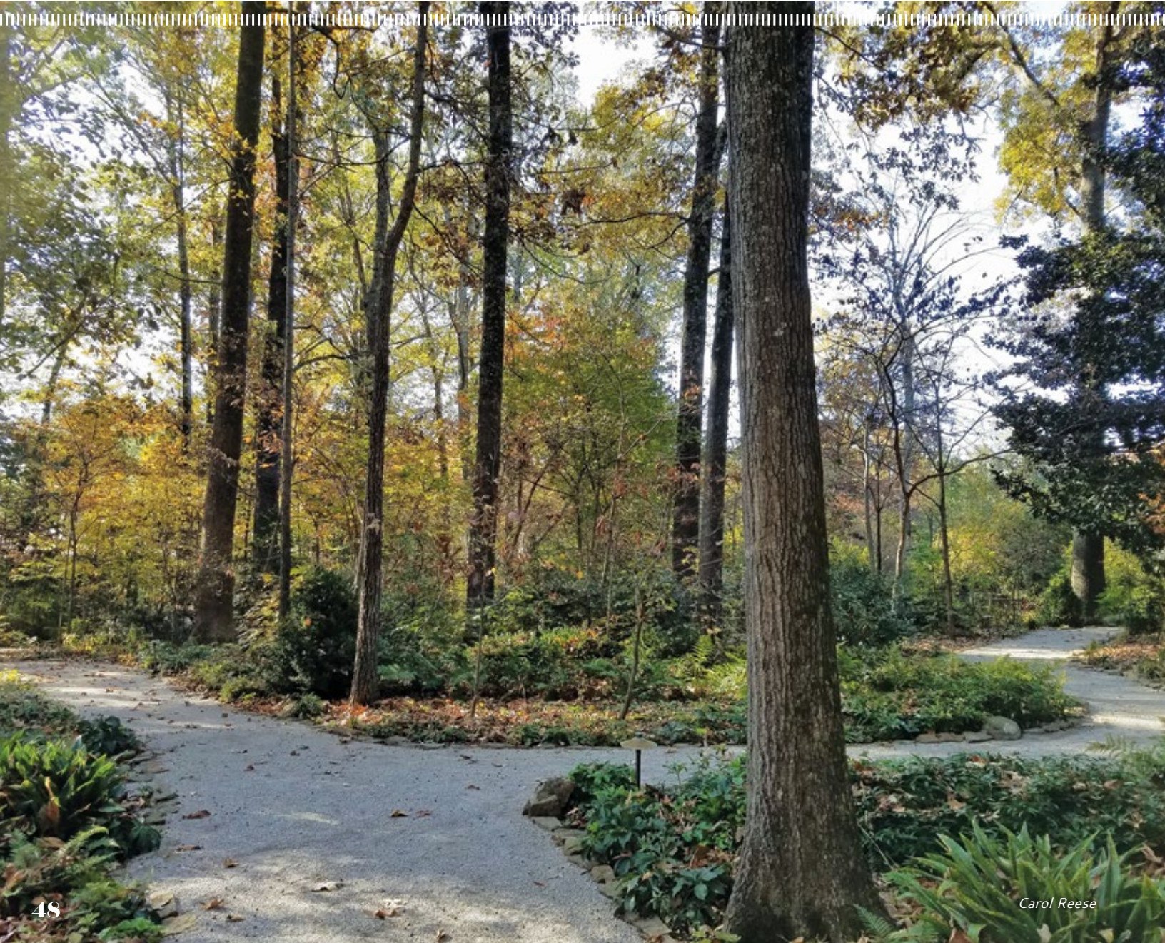
Example of a no-mow backyard.

and control others. The best application of control methods requires balancing the needs of yourself and other residents as well as the wildlife in the area. For homeowners and gardeners seeking to create attractive habitat for various wildlife species and solve nuisance wildlife issues, this information along with other supplemental resources and advice from UT Extension, TWRA, and USDA-Wildlife Services professionals should help in managing wildlife to create an enjoyable and sustainable residential area.