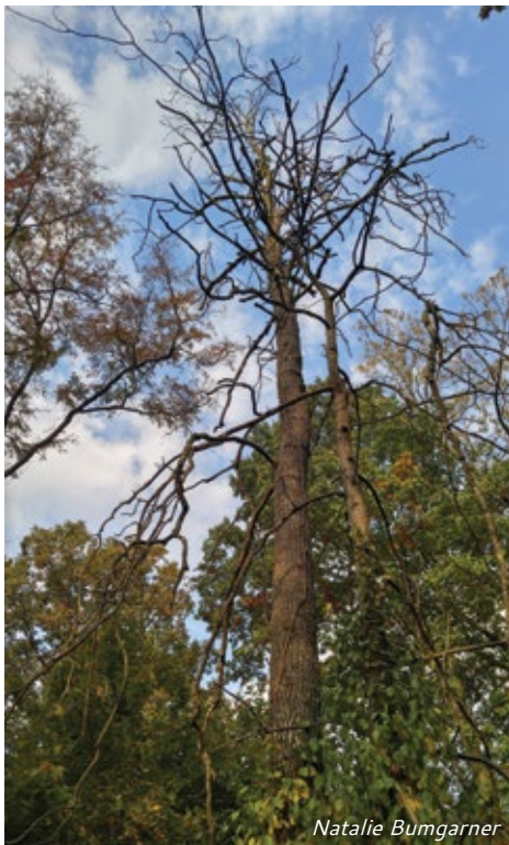
Left: Standing dead trees provide something for many wildlife species.

Standing dead trees, often called snags, are excavated by woodpeckers to feed on insects that inhabit decomposing wood and to provide nesting cavities that later are used by many other species. At least 85 North American species use cavities created by woodpeckers and decay, including bluebirds, tree swallows, flycatchers, chickadees, titmice, owls, wrens, wood ducks, flying squirrels, bats, raccoons, gray foxes, honeybees, and even black bears. The open area around snags gives a clear view for predator species, so they are used by raptors, such as hawks, owls, and eagles, as well as insectivores, such as bluebirds, kingbirds, and flycatchers. Around water sources, herons and egrets will