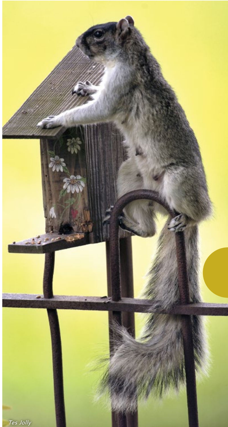
Squirrels can dominate bird feeders and consume or waste a lot of bird seed by knocking it out or off the feeder onto the ground where most of it germinates or becomes moldy. Both gray squirrels and fox squirrels (above) can be problematic.

Exclusion is the best defense against chipmunks around your home. Heavy-duty hardware cloth with ¼-inch mesh, caulking, mortar, or additional boarding should be used to close access areas. Flower gardens can be protected by covering the seedbed with hardware cloth, then placing a layer of soil on top. Areas of woody vegetation or other groundcover that connect shrubbery around your home with an adjacent woodlot provide chipmunks a ready-made travel corridor. Woodpiles and groundcover can hide burrow entrances, making them difficult to detect.