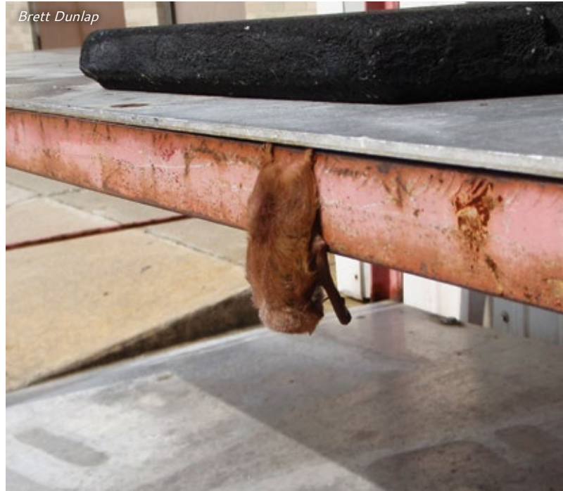
Roosting bats can be problematic in homes. Preventing access is key to controlling the problem.

Moles are small mammals that spend most of their lives in underground burrows. Three species of moles live in Tennessee. The eastern mole ( Scalopus aquaticus ) is found throughout the state. The hairy-tailed mole ( Parascalops breweri ) and the star-nosed mole ( Condylura cristata ) both are found only in extreme eastern Tennessee. Measuring 6–8 inches from tip of nose to tip of tail, they are similar in appearance to shrews and mice, and they may occupy the same area. The mole's most notable feature is the greatly enlarged paddle-like forefeet and prominent toenails that enable the mole to almost literally "swim" through the soil. Their legs are strong, their necks are short, and their heads are elongated. Their ears and eyes are so small that at first glance they appear to be missing. A mole's fur is soft and velvety. It ranges in color from black to brownish or grayish with silver highlights. When brushed, the fur offers