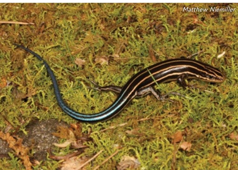
A juvenile broadhead skink has a bright blue tail, similar to a juvenile 5-lined skink.

Even though lizards native to Tennessee are harmless and beneficial, many people still want to remove them. Lizards are easily controlled and removed with glue boards. As with snakes, glue boards should be placed against walls and other structures where lizards commonly travel. Lizards can be safely released from glue boards by pouring vegetable oil over the lizards. Lizards are protected in Tennessee and indiscriminate killing is illegal. Permission from your county wildlife officer and a permit from TWRA are necessary to keep one in captivity.