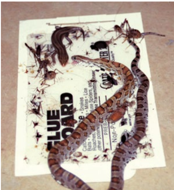
Above: Glue boards are very effective at catching “critters” in the house. Beneficial animals, such as this corn snake, can be released unharmed by pouring vegetable oil over the animal, which helps dissolve the glue and releases the trapped animal.

Glue boards are effective for trapping and removing small- to medium-sized snakes. Vegetable oil is used to dissolve the glue and release the snake unharmed once the snake has been relocated. Snake repellants are not effective. Exclusion is the most important step in avoiding problems with snakes in homes or other buildings. All openings into buildings ¼-inch or larger should be sealed by some means, such as boards, mortar, steel wool, sheet metal, or hardware cloth.