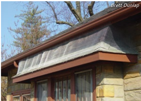
Top: Electric fences are effective for many needs, whether helping protect chickens or a garden from unwanted pests or predators.