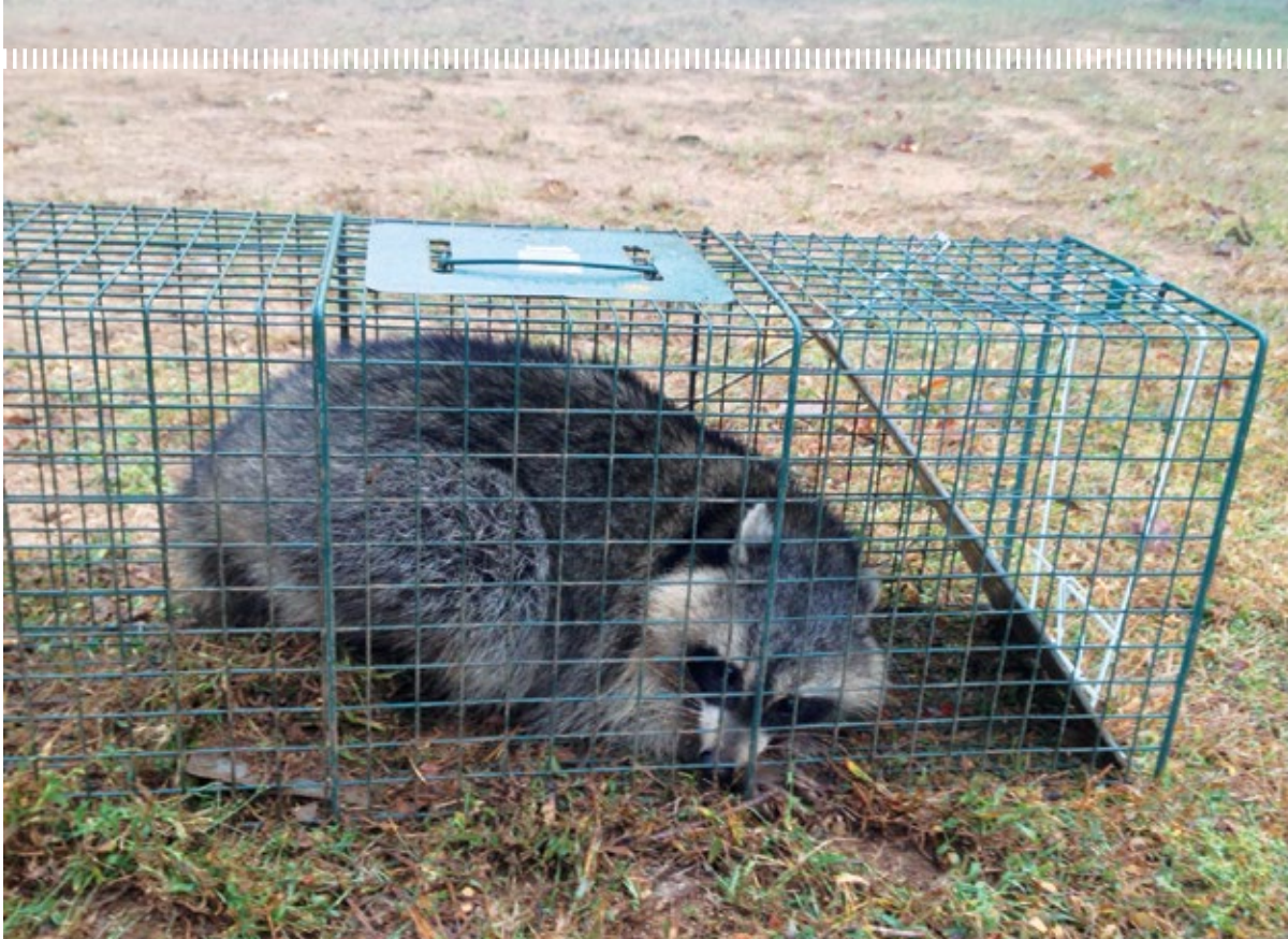
Live traps are very effective for some mammals, including opossums and raccoons.

trigger. For many rodents, snap-traps baited with peanut butter and bird seed is effective. For groundhogs (which are also rodents) and rabbits (which are not rodents), fresh vegetables are effective. For most carnivores and omnivores (such as raccoons, opossums, foxes, skunks, and cats), sardines, pet food, or raw chicken scraps are effective. Traps should be checked daily.